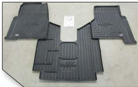
Figure 2- Kit FKFRTLASCMB Contents