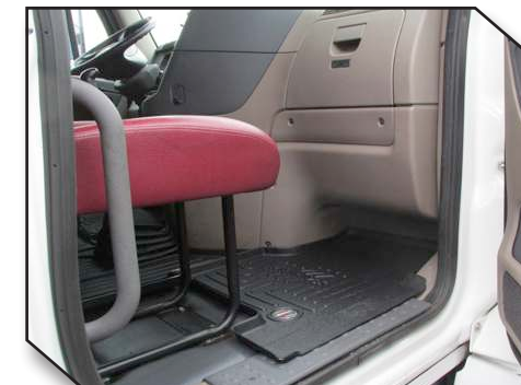
Figure 13 - Passenger Mat With Fixed Seat

20. Pull the driver mat toward the front of the truck to confirm that the hook is fully engaged into the mat and that the hook is adhered to the floor. If the hook is not functioning properly or the mat cannot be securely installed, do not use a Minimizer floor mat on the driver side of the vehicle.