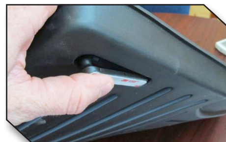
Figure 9 - Hook Insertion

10. Once the hook is in place, let the driver mat and hook rest on the floor as shown in Figure 10.