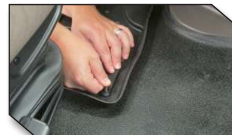
Figure 7 - Apply Pressure to Hook

18. For optimal adhesion do not disturb the hook for a period of 20 minutes after installation. Figure 12 below shows the proper installation of the hook.