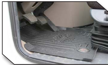
Figure 7 - Driver Mat in Position

8. Inside the package with the installation instructions, locate a black plastic retention hook as well as a white tube of Primer 94 as shown in Figure 8.