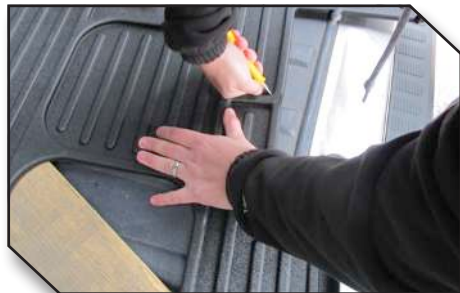
Figure 4 – Trimming With Utility Knife

Note: Figure 5 below shows the center mat from kit FKFRTLASCMB installed in a day cab truck. This mat was trimmed to fit around the existing fire extinguisher and DOT roadside safety kit.