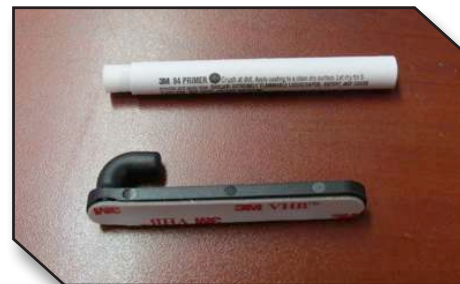
Figure 8 - Hook and Primer 94

9. Insert the hook up through the hole at the right rear corner of the driver mat as shown in Figure 9. The hook should fit flush with the underside of the driver mat.