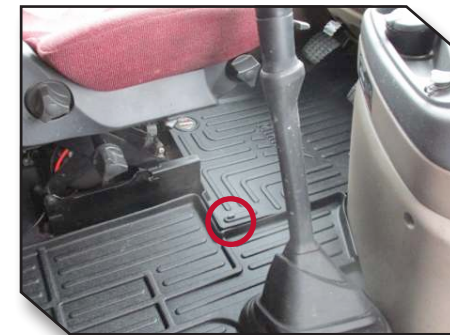
Figure 10 – Confirm Location Driver Mat and Hook

11. Mark the approximate position where the hook will need to be attached to the floor with a finger. Once the position is located, remove the driver mat from the truck.