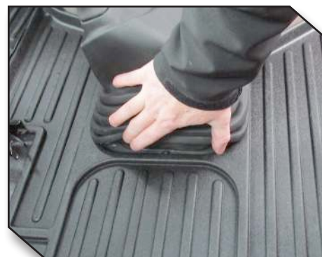
Figure 6 - Straightening Rubber Boot

7. Position the driver mat in the truck as shown in Figure 7.