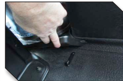
Figure 12 – Properly Installed Hook

18. For optimal adhesion do not disturb the hook for a period of 20 minutes after installation. Figure 12 below shows the proper installation of the hook.