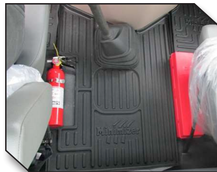
Figure 5 – Trimmed Center Mat Installed

6. Straighten the rubber boot that surrounds the gear shift so it rests smoothly on top of the center mat as shown below in Figure 6.