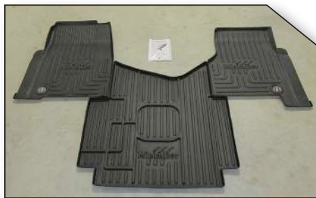
Figure 1 – Kit FKFRTLASCAB Contents