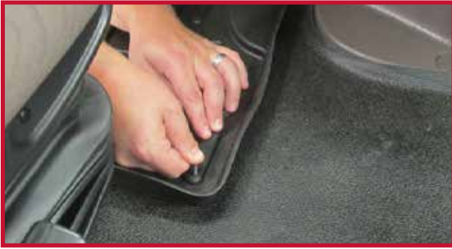
Figure 14 - Apply Pressure to Hook

15. Position the passenger floor mat in the truck. Make sure the passenger mat is pushed all the way forward so the outside lip makes full contact with the doghouse trim panel and fire wall as shown in Figure 15.