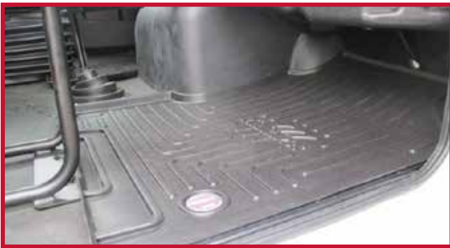
Figure 15 - Passenger Mat in Position

Note: The passenger floor mat is designed to accommodate both fixed seats and suspension seats. Trucks that are equipped with a fixed base passenger seat as shown in Figure 10 will need to be hand trimmed prior to installation. See figure 16 below that shows the green and orange shaded areas. Aftermarket seats may also require hand trimming. There are two raised ribs molded into the passenger mat to act as trim guides. To confirm which line to trim along test fit the mat against the seat base. Use a sharp utility knife to trim along the outside edge of the rib. Preserve the rib for liquid containment.