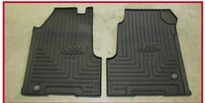
Figure 8 - Kit 103086 Contents