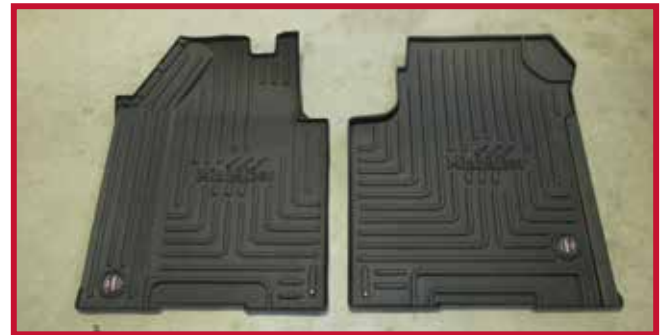
Figure 13 - Driver Mat Hook in Position