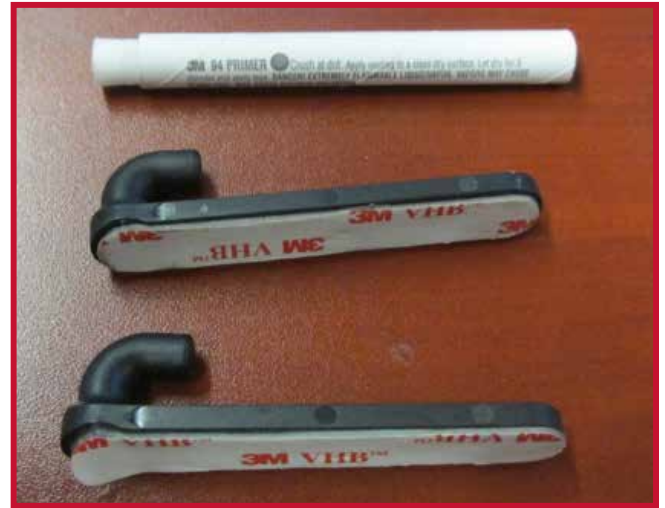
Figure 12 - Retention Hooks and Primer 94