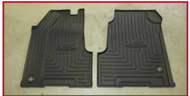
Figure 7 - Kit 103085 Contents