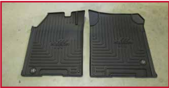
Figure 3 - Kit 103082 Contents