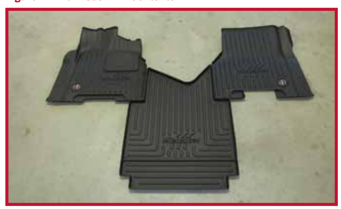
Figure 2 - Kit #10002277 Contents

Contents of floor mat kit # #10002277 are shown below in Figure 2.