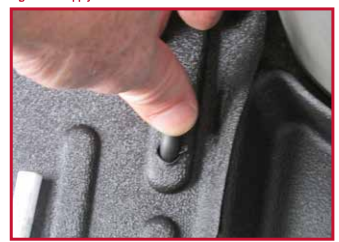
Figure 10 - Apply Pressure to the Hook

18. For optimal adhesion do not disturb the retention hook for a period of 20 minutes after installation. Figure 11 below shows the properly installed driver mat and hook.