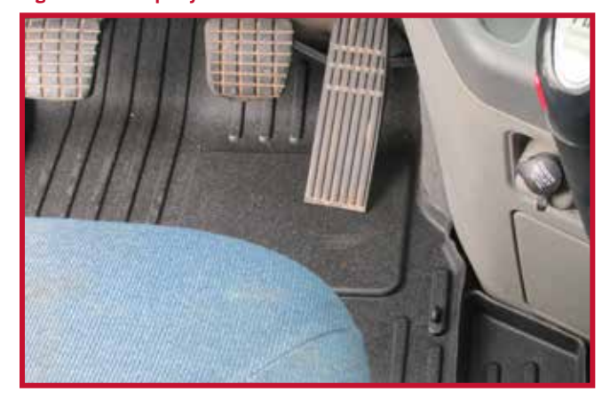
Figure 11 - Properly Installed Driver Mat and Hook

18. For optimal adhesion do not disturb the retention hook for a period of 20 minutes after installation. Figure 11 below shows the properly installed driver mat and hook.