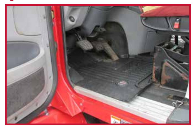
Figure 6 - Driver Mat Fit with OEM Seat Base

Note: When installing in trucks equipped with an EzyRider driver seat the floor mat material behind the raised rib will need to be trimmed away with a utility knife as shown in Figure 7. The raised rib is designed to act as a knife guide and contain liquid. Trucks that are outfitted with aftermarket seats or have had the seat position altered may also require hand trimming along the raised rib.