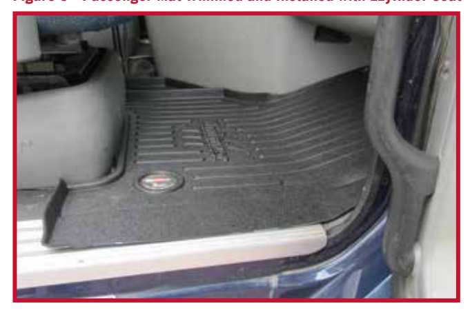
Figure 5 - Passenger Mat Trimmed and Installed with EzyRider Seat

7. Test fit the driver mat in the truck. The driver mat is designed to fit underneath the throttle pedal. To install the driver mat, lift up the heel portion of the throttle pedal and slide the front of the floor mat underneath the pedal. Confirm that the mat is pushed all the way forward so it rests against the fire wall. Figure 6 below shows the driver mat installed in a truck with an OEM seat.