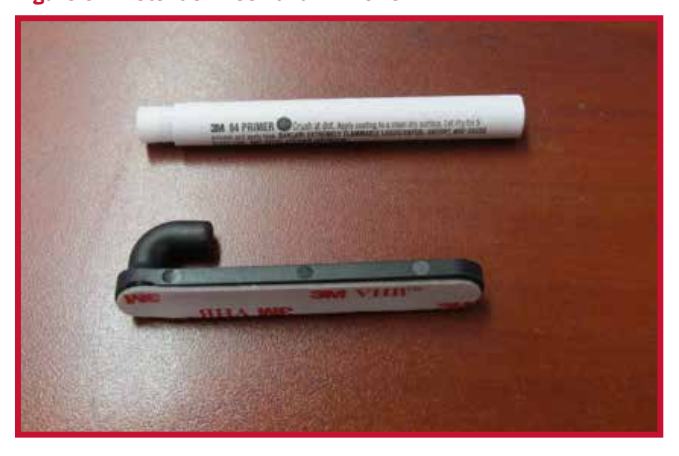
Figure 8 - Retention Hook and Primer 94

9. Insert the hook through the hole at the right edge of the driver mat as shown in Figure 9. The hook should fit flush with the underside of the driver mat.