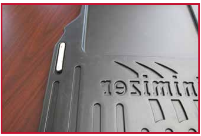
Figure 9 - Hook Inserted in Driver Mat

10. Once the hook is in place, let the driver mat and hook rest on the truck floor.