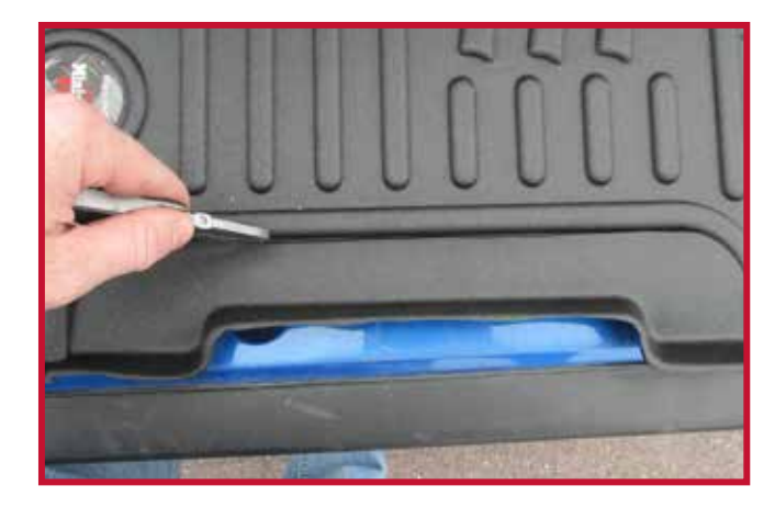
Figure 7 – Driver Mat Trim for Installation With Ezy Rider Seat or Aftermarket Seat.

8. Inside the package with the installation instructions, locate a black plastic retention hook as well as a white tube of Primer 94 as shown in Figure 8.