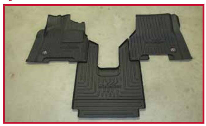
Figure 1 - Kit #10002290 Contents

Contents of floor mat kit # #10002277 are shown below in Figure 2.