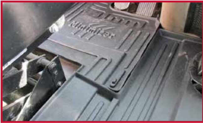
Figure 9 - Driver Mat Hook in Position

Mark the approximate position where the hook needs to be attached to the floor. Once the position is located, remove the driver mat from the truck.