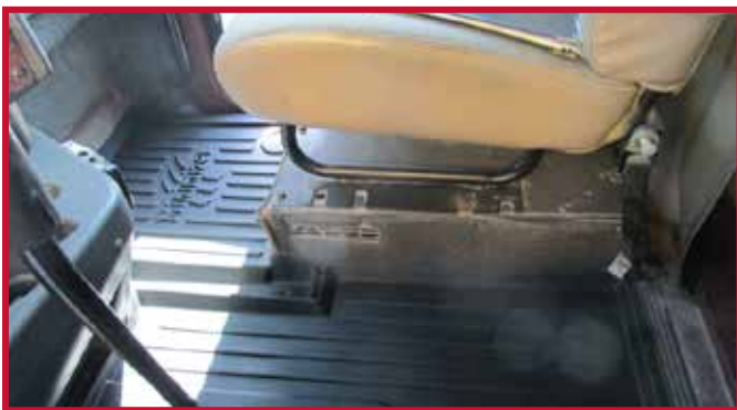
Figure 1 - Premium Interior (No Cup Holder)