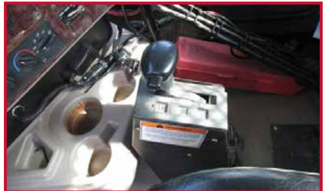
Figure 8 - Floor Mounted Control Tower

Note: Some older trucks with automatic transmissions are equipped with a control tower that is fastened to the floor as shown in Figure 8. Hand trimming of the center mat is required for compatibility with floor mounted control towers.