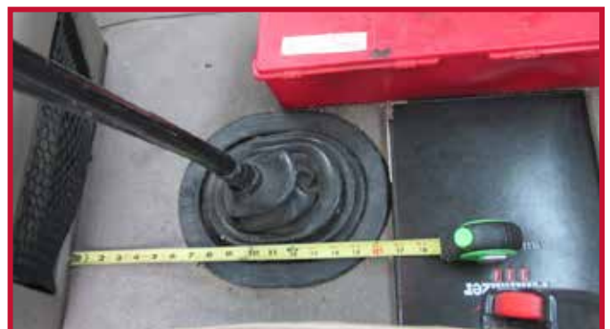
Figure 3 - Distance Measured from Doghouse to Gearshift