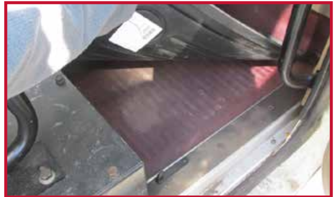
Figure 11 - Passenger Mat Hook in Position

18. Confirm that the retention hook is fully engaged into the driver mat and that the hook is adhered to the floor. If the driver mat retention hook is not functioning properly or the mat cannot be securely installed, do not use a Minimizer floor mat on the driver side of the vehicle.