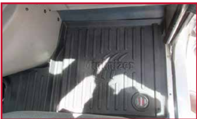
Figure 10 - Passenger Mat in Position

16. Position the passenger floor mat in the truck. Make sure the passenger mat is pushed all the way forward so the outside lip makes full contact with the doghouse trim panel and fire wall as shown in Figure 10.