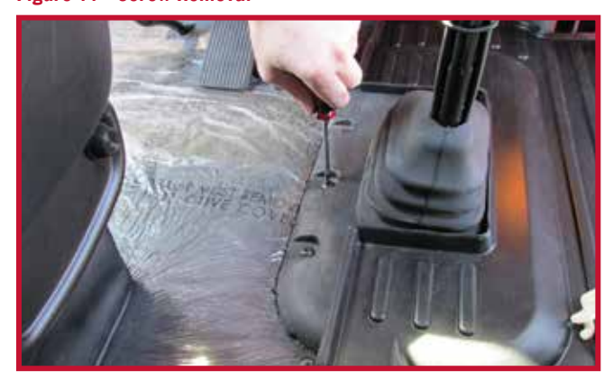
Figure 11 - Screw Removal

b) Insert the screw through the hole in the retention hook as shown in Figure 12.