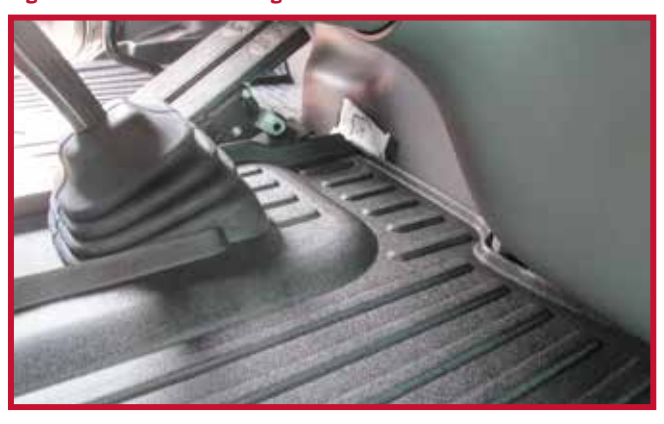
Figure 8 - Fit After Trimming

8. Next install the mat for the passenger side of the vehicle as shown in Figure 9.