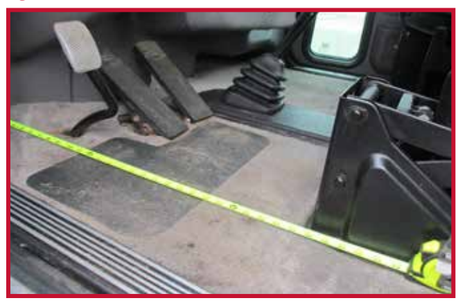
Figure 1 - Driver Seat Measurement

Measure from the lower kick panel of the dashboard to the front of the seat base. This measurement will determine the correct kit for your truck.