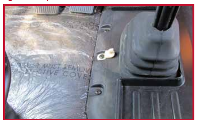
Figure 13 - Proper Hook Orientation

c) Insert the hook through the hole in the transmission cover and tighten using a #3 Phillips screwdriver. Orient the hook so it points straight toward the gearshift as shown in Figure 13.