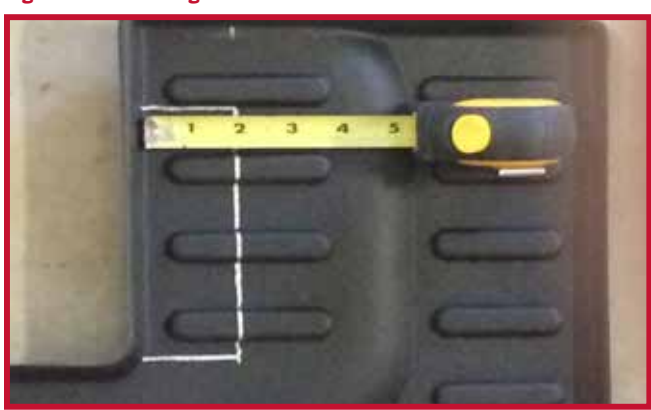
Figure 7 - Trimming Measurements

7. For cases where a fire extinguisher is mounted behind the driver seat, the left rear corner of the center mat shaded in yellow may be trimmed to allow for clearance.