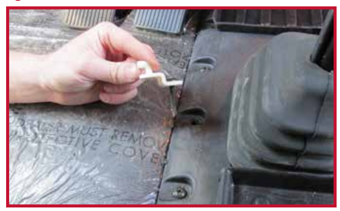
Figure 12 - Hook Installation

c) Insert the hook through the hole in the transmission cover and tighten using a #3 Phillips screwdriver. Orient the hook so it points straight toward the gearshift as shown in Figure 13.