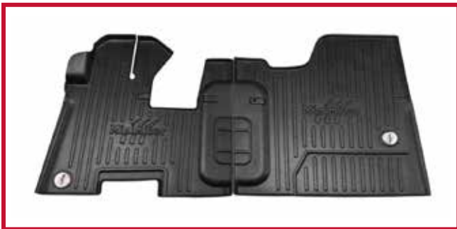
Figure 10 - Floor Mat Kit 10002655