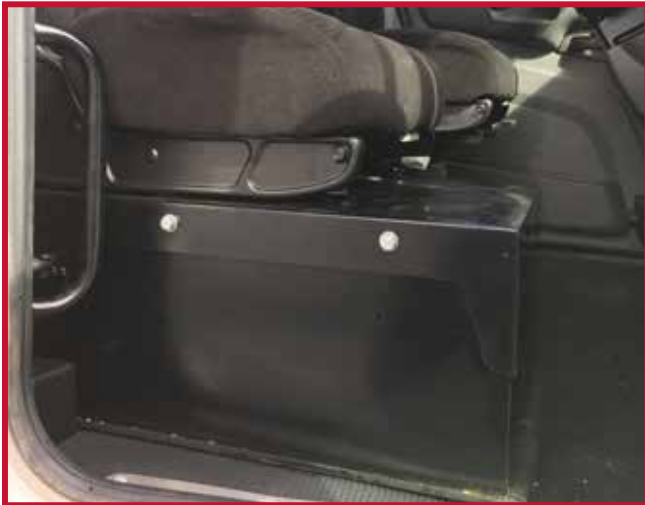
Figure 8 - Battery Box Passenger Seat Base