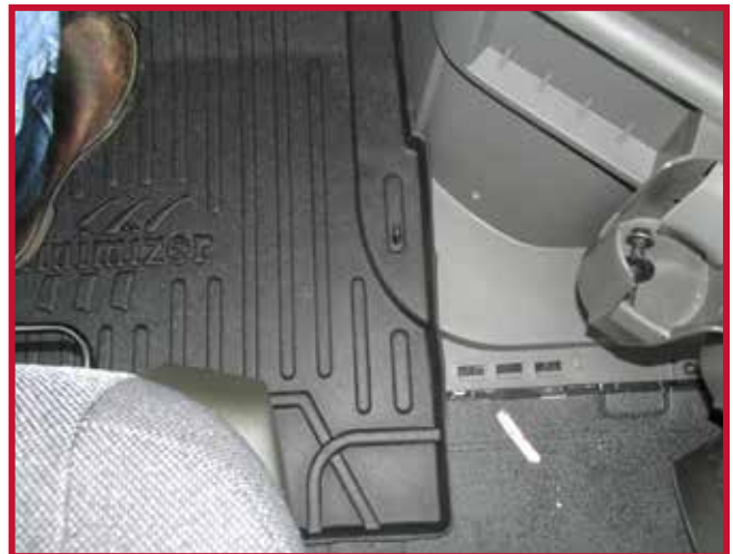
Figure 7 - Driver Mat Hook Installation

18. Pull the driver mat toward the rear of the truck to confirm that the hook is fully engaged into the mat and that the hook is adhered to the molding. If the hook is not functioning properly or the mat cannot be securely installed, do not use a Minimizer floor mat on the driver side of the vehicle.