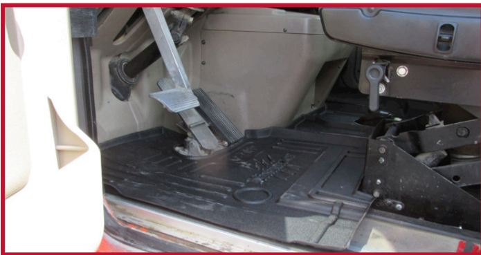
Figure 1 - Driver Mat Position