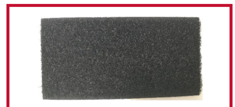
Figure 4 - Loop Strip