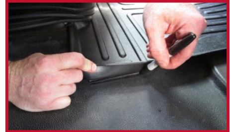
Figure 6 - Apply Pressure