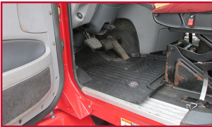
Figure 1 - Driver Mat Fit with OEM Seat Base