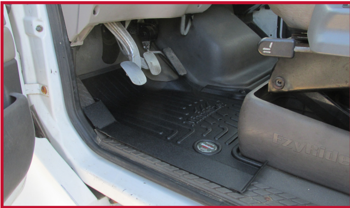
Figure 1 - Driver Mat Installation with EzyRider Seat