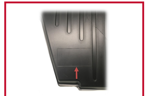
Figure 4 - Rectangular Guideline