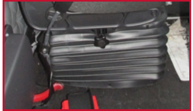
Figure 3 - Hand Trimming for Seat with Rubber Boot