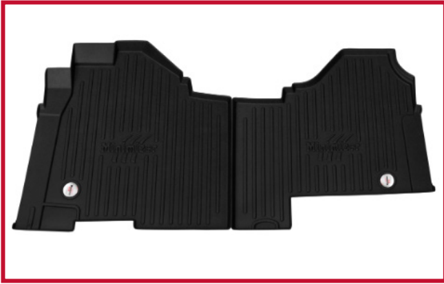
Figure 1 – Floor Mat Kit 10006831