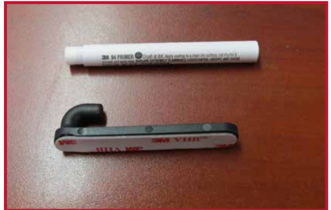
Figure 8 - Retention Hook and Primer 94

9. Insert the hook through the hole at the right edge of the driver mat as shown in Figure 9. The hook should fit flush with the underside of the driver mat.