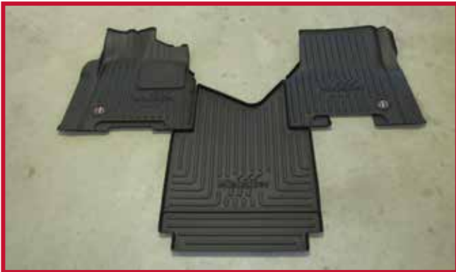
Figure 2 - Kit #10002277 Contents