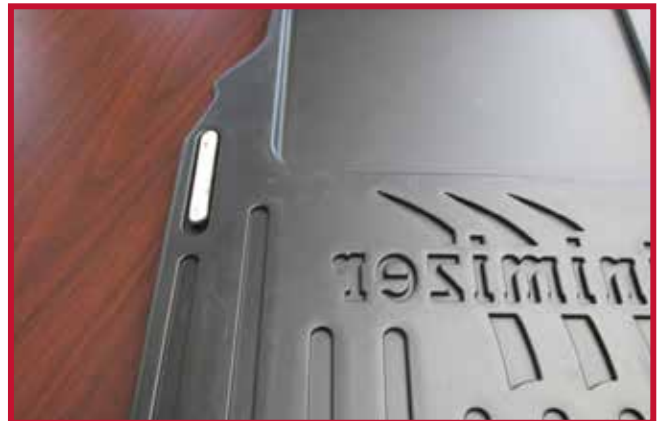
Figure 9 - Hook Inserted in Driver Mat

10. Once the hook is in place, let the driver mat and hook rest on the truck floor.