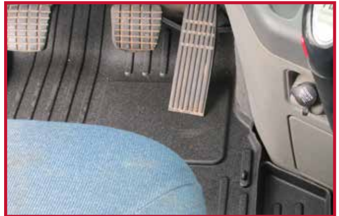
Figure 11 - Properly Installed Driver Mat and Hook