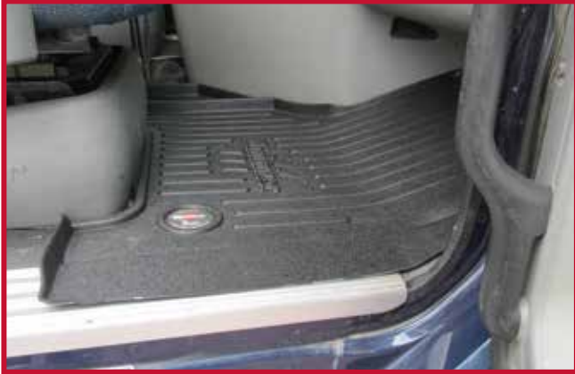
Figure 5 - Passenger Mat Trimmed and Installed with EzyRider Seat

7. Test fit the driver mat in the truck. The driver mat is designed to fit underneath the throttle pedal. To install the driver mat, lift up the heel portion of the throttle pedal and slide the front of the floor mat underneath the pedal. Confirm that the mat is pushed all the way forward so it rests against the fire wall. Figure 6 below shows the driver mat installed in a truck with an OEM seat.