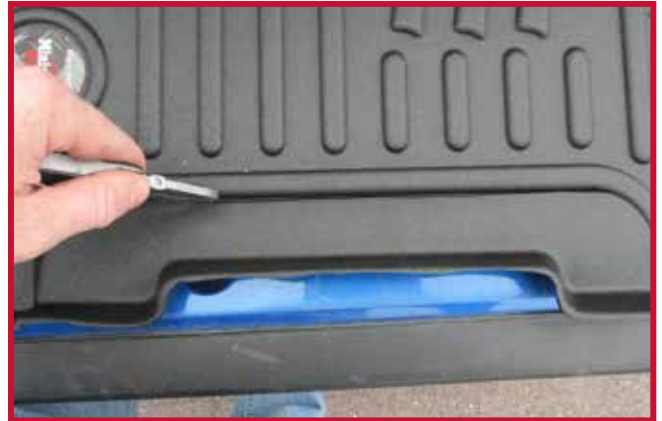
Figure 7 – Driver Mat Trim for Installation With Ezy Rider Seat or Aftermarket Seat.

8. Inside the package with the installation instructions, locate a black plastic retention hook as well as a white tube of Primer 94 as shown in Figure 8.