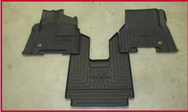
Figure 1 - Kit #10002290 Contents