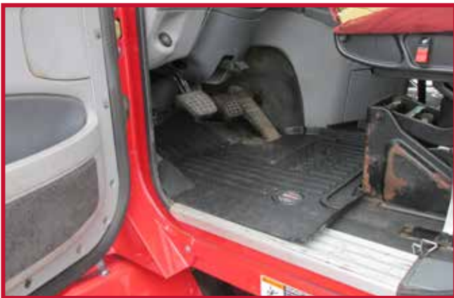
Figure 6 - Driver Mat Fit with OEM Seat Base

Note: When installing in trucks equipped with an EzyRider driver seat the floor mat material behind the raised rib will need to be trimmed away with a utility knife as shown in Figure 7. The raised rib is designed to act as a knife guide and contain liquid. Trucks that are outfitted with aftermarket seats or have had the seat position altered may also require hand trimming along the raised rib.