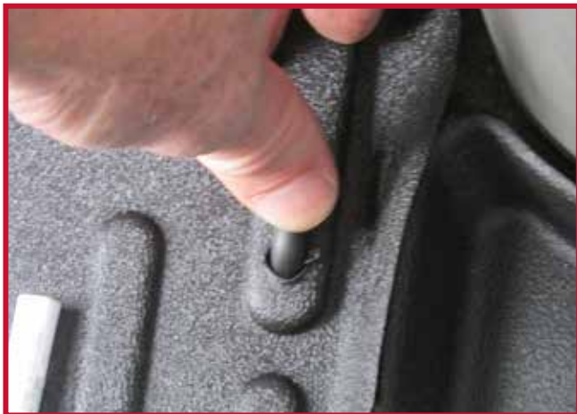
Figure 10 - Apply Pressure to the Hook