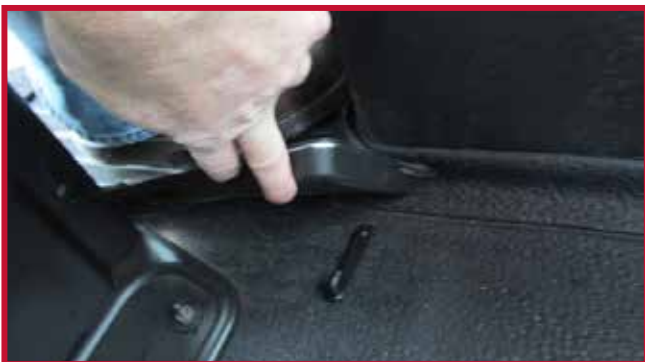
Figure 12 – Properly Installed Hook

18. For optimal adhesion do not disturb the hook for a period of 20 minutes after installation. Figure 12 below shows the proper installation of the hook.