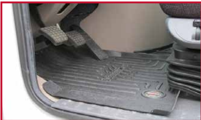
Figure 7 - Driver Mat in Position

8. Inside the package with the installation instructions, locate a black plastic retention hook as well as a white tube of Primer 94 as shown in Figure 8.