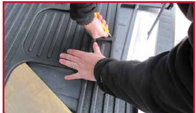
Figure 4 – Trimming With Utility Knife

Note: Using the edges of the tall ribs as a guide, trim off the desired portion of the mat with a sharp utility knife as shown in Figure 4. Always trim along the inside boundary of the shaded area. This will preserve tall rib profile to help with spill containment.