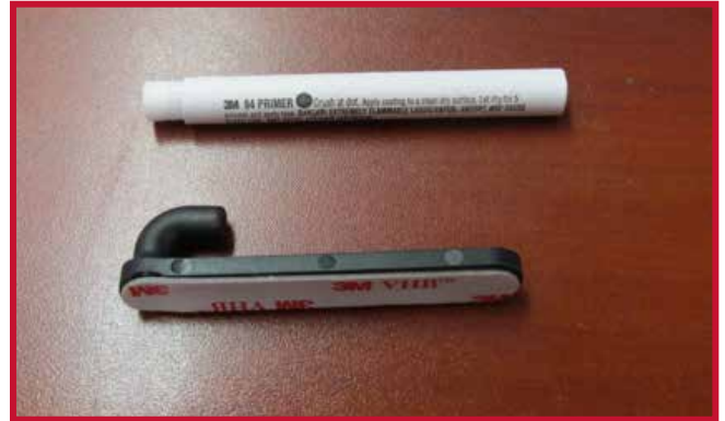
Figure 8 - Hook and Primer 94

9. Insert the hook up through the hole at the right rear corner of the driver mat as shown in Figure 9. The hook should fit flush with the underside of the driver mat.