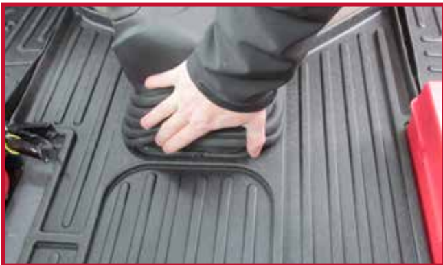
Figure 6 - Straightening Rubber Boot

7. Position the driver mat in the truck as shown in Figure 7.