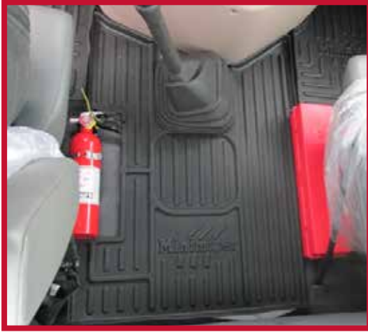
Figure 5 – Trimmed Center Mat Installed

6. Straighten the rubber boot that surrounds the gear shift so it rests smoothly on top of the center mat as shown below in Figure 6.