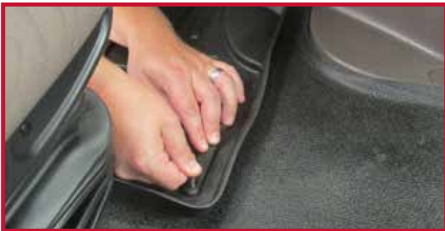
Figure 11 - Apply Pressure to Hook

18. For optimal adhesion do not disturb the hook for a period of 20 minutes after installation. Figure 12 below shows the proper installation of the hook.