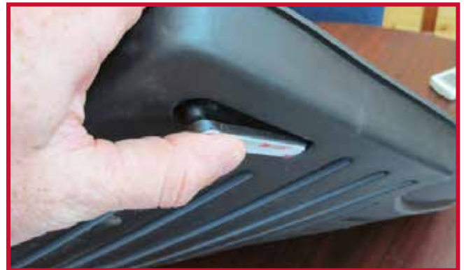
Figure 9 - Hook Insertion

10. Once the hook is in place, let the driver mat and hook rest on the floor as shown in Figure 10.