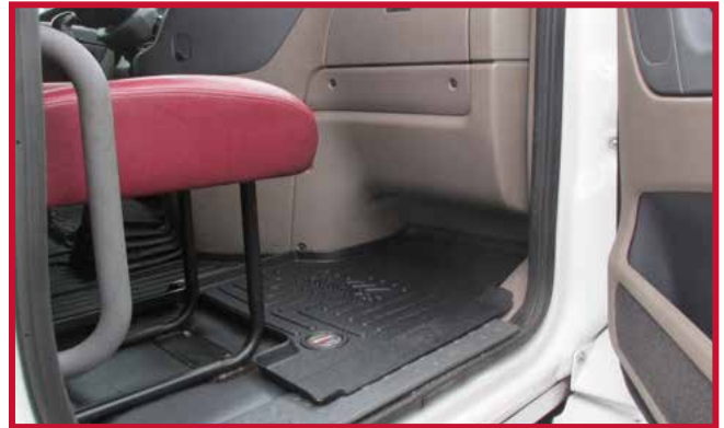
Figure 13 - Passenger Mat With Fixed Seat

20. Pull the driver mat toward the front of the truck to confirm that the hook is fully engaged into the mat and that the hook is adhered to the floor. If the hook is not functioning properly or the mat cannot be securely installed, do not use a Minimizer floor mat on the driver side of the vehicle.