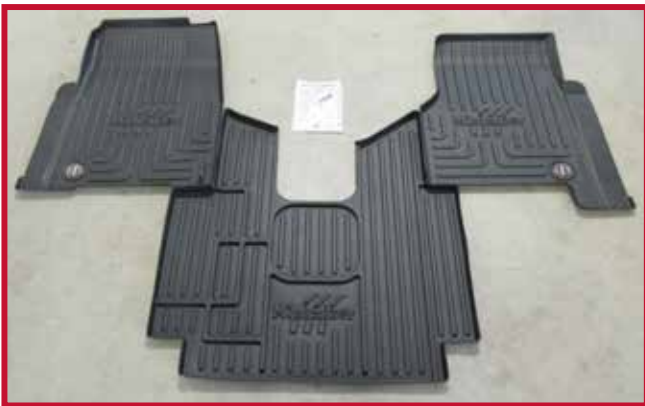
Figure 2- Kit #10002231 Contents