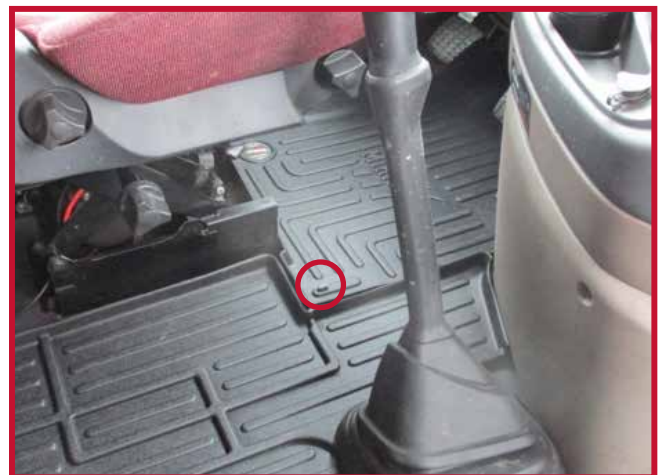
Figure 10 – Confirm Location Driver Mat and Hook

11. Mark the approximate position where the hook will need to be attached to the floor with a finger. Once the position is located, remove the driver mat from the truck.