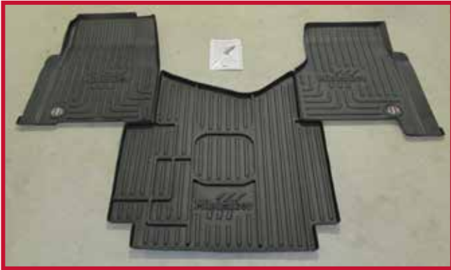
Figure 1 – Kit #10002211 Contents