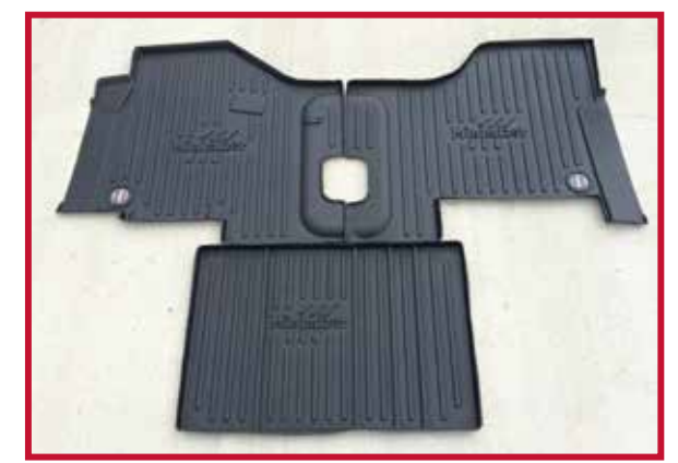
Figure 1 - KIT #10002633 Contents

• Kit #10002608 shown in Figure 2 is compatible with Kenworth T680 & T880, and Peterbilt 579 & 567 models that are equipped with an Automatic transmission.