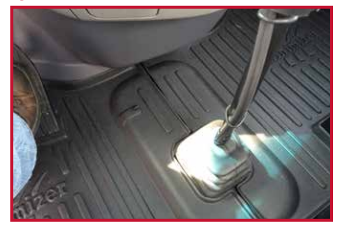
Figure 9 - Kit 10002633 Driver Mat with Retention Hook

c) Finish installing the driver side floor mat and engage it into the retention hook. The driver mat must be pushed all the way forward so the front lip is makes full contact with the lower dashboard kick panels as shown in Figure 9.