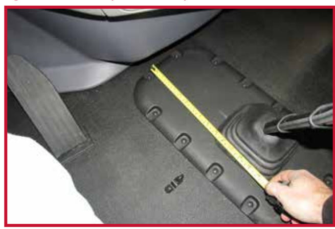
Figure 7 - Hook and Spacer Assembly

b) Locate the retention hook provided in the floor mat kit. Insert the screw through the hole in retention hook and replace the screw in transmission cover. Tighten the screw using a #3 Phillips screwdriver. Orient the hook so the tip points toward the passenger side. Figure 8 below shows the proper hook orientation.