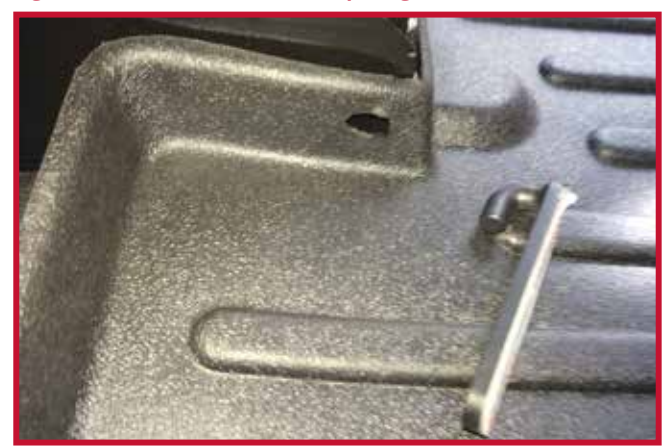
Figure 10 - Driver Mat with Hook Opening

e) Remove the driver mat from the truck.