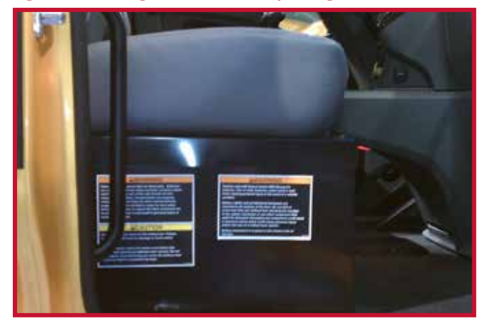
Figure 4 - Passenger Seat with Battery Storage

• Trucks equipped with a factory thermos holder will require hand trimming of the center mat. A raised trim line is molded into the floor mat to use as a guide and for liquid containment.