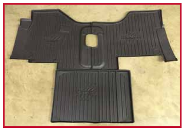
Figure 3 - KIT #10002647 Contents

• The passenger side floor mat is not compatible with trucks equipped with a passenger seat base battery storage unit as shown in Figure 4.