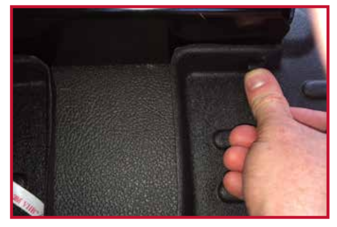
Figure 11 - Apply Pressure to Hook

8. FAILURE TO PROPERLY INSTALL THE RETENTION HOOK FOR THE DRIVER SIDE FLOOR MAT MAY ALLOW THE MAT TO SHIFT, WHICH MAY INTERFERE WITH PROPER FUNCTIONING OF THE VEHICLE'S PEDALS, POTENTIALLY RESULTING IN LOSS OF CONTROL OFTHE VEHICLE AND SERIOUS INJURY OR DEATH.