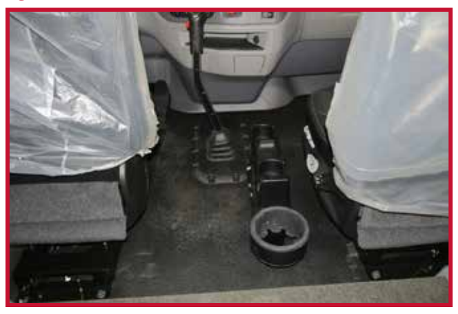
Figure 5 - Thermos Holder

5. Test fit the center mat in between the seats of the truck. If the truck is equipped with a factory thermos holder as shown in Figure 5, trimming will be required. If no thermos holder is present, install the center mat so the logo reads from left to right when facing forward in the cab. If the truck is equipped with a thermos holder, follow the trimming guidelines below and refer to Figure 6 for a diagram of areas to trim. Use a sharp utility knife to trim the center mat.