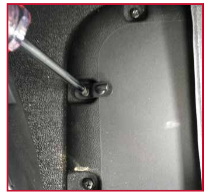
Figure 8 - Retention Hook Installation

c) Finish installing the driver side floor mat and engage it into the retention hook. The driver mat must be pushed all the way forward so the front lip is makes full contact with the lower dashboard kick panels as shown in Figure 9.