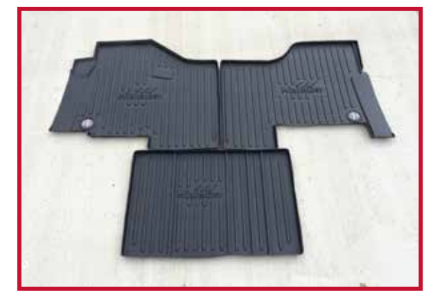
Figure 2 - KIT #10002608 Contents

• Kit #10002647 shown in Figure 3 is compatible with Kenworth W990's that are equipped with an Automatic transmission.