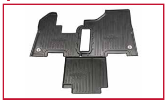
Figure 1 - KIT #10002702 Contents

• Kit #10002712 shown in Figure 2 is compatible with Peterbilt 357, 377, 378, 379, 385 trucks built prior to 5/2004.