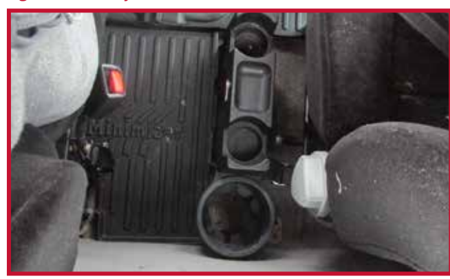
Figure 3 - Factory Thermos Holder

For cases where a fire extinguisher is mounted behind the driver seat, the left rear corner of the center mat shaded in yellow may be trimmed to allow for clearance.