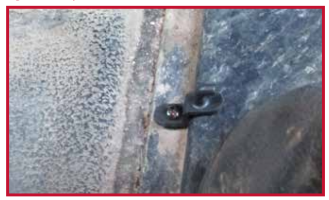
Figure 7 - Proper Hook Orientation

9. Install the driver side floor mat and engage it into the retention hook. If the position of the seat base is nonstandard or the truck is equipped with aftermarket seats it may be necessary to trim the rear portion of the driver or passenger mat to fit. There is a raised rib molded into the driver and passenger mat to contain liquids and act as a trim guide. Use a sharp utility knife as shown in Figure 8 to trim the material and cut along the outside of raised rib preserving the rib for liquid containment.