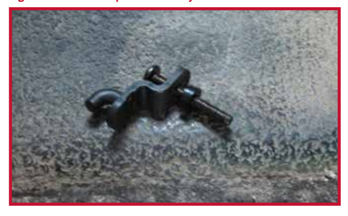
Figure 6 - Hook and Spacer Assembly

c) Insert the hook assembly through the transmission cover and tighten using a #3 Phillips screwdriver. Orient the floor mat hook so it points straight toward the gearshift as shown in Figure 7.