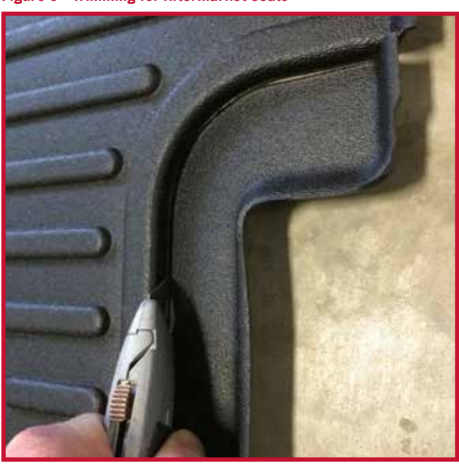
Figure 8 - Trimming for Aftermarket Seats

9. Install the driver side floor mat and engage it into the retention hook. If the position of the seat base is nonstandard or the truck is equipped with aftermarket seats it may be necessary to trim the rear portion of the driver or passenger mat to fit. There is a raised rib molded into the driver and passenger mat to contain liquids and act as a trim guide. Use a sharp utility knife as shown in Figure 8 to trim the material and cut along the outside of raised rib preserving the rib for liquid containment.