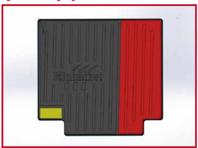
Figure 4 - Trimming Diagram

For cases where a fire extinguisher is mounted behind the driver seat, the left rear corner of the center mat shaded in yellow may be trimmed to allow for clearance.