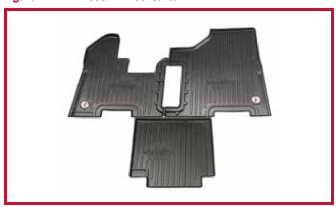
Figure 2 - KIT #10002712 Contents

Trucks equipped with a factory thermos holder require hand trimming of the center mat. A raised trim line is molded into the floor mat to use as a guide and for liquid containment.