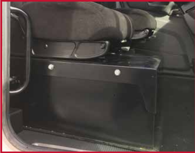
Figure 8 - Battery Box Passenger Seat Base