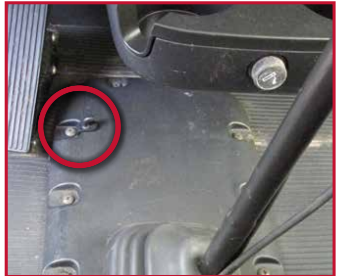
Figure 15 - Brake-Pedal Mounting Bolt

17. Prior to operating the vehicle, read the Safety Instructions for Vehicle Operation.