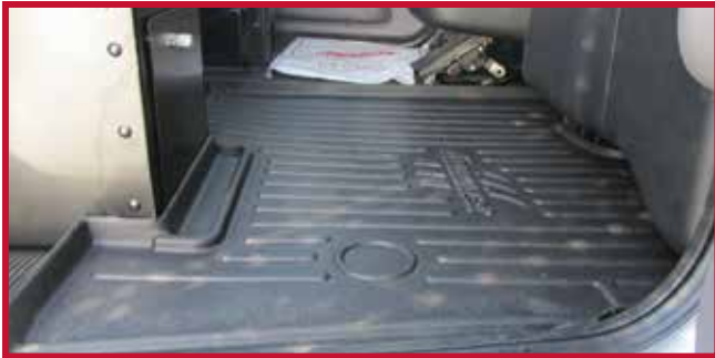
Figure 2 - Passenger Seat with Storage Compartment