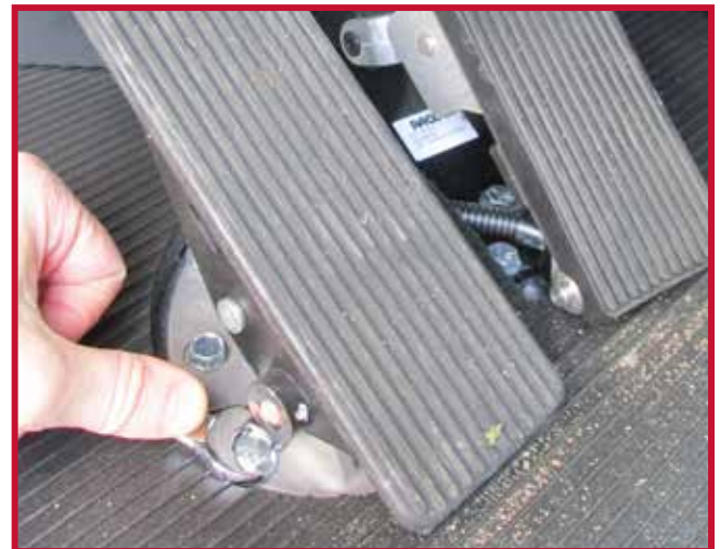
Figure 12 - Brake-Pedal Mounting Bolt