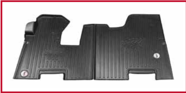
Figure 1 - Floor Mat Kit 10002732