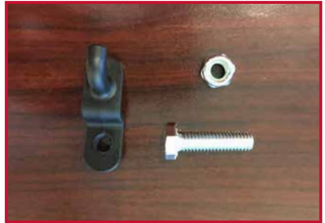
Figure 11 - Retention Hook & Hardware