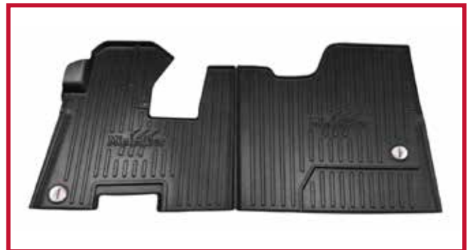
Figure 6 - Floor Mat Kit 10002652