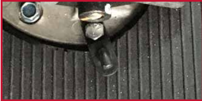
Figure 13 - Retention Hook & Hardware

11. Place the driver mat in the truck and attach mat to the retention hook.