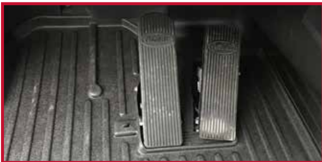
Figure 14 - Driver Mat Installed with Hook

12. Pull on the driver mat to confirm that the hook is fully engaged in the mat. If the hook is not functioning properly or the mat cannot be securely installed, do not use a Minimizer floor mat on the driver side of the vehicle.