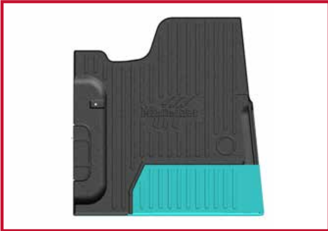
Figure 9 - Trimming Diagram