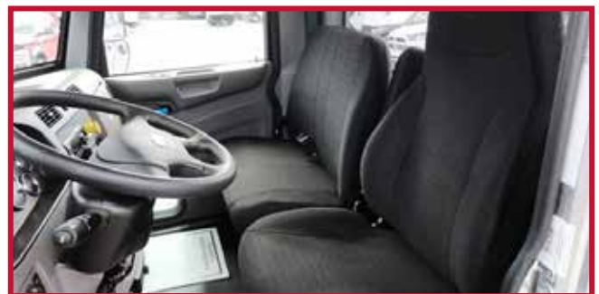
Figure 7 - Two-Man Bench Seat