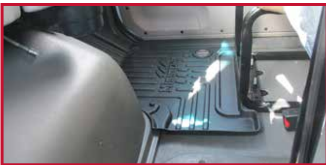
Figure 13 - Passenger Mat Hook Installed on Doghouse Trim

17. Confirm that the retention hook is fully engaged into the driver mat and that the hook is adhered to the floor. If the driver mat hook is not functioning properly or the mat cannot be securely installed, do not use a Minimizer floor mat on the driver side of the vehicle.