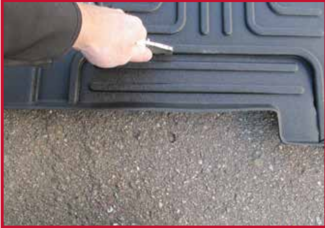
Figure 8 - Trimming for EzyRider Seat

CAUTION: Minimizer floor mats are designed to be used with the factory rubber flooring in good condition. If the factory floor is in poor condition (has humps or bubbles) due to excessive moisture, the floor mat may not sit in place properly. If the floor mat does not sit in place properly there is risk that the floor mat will interfere with the brake and throttle pedals.