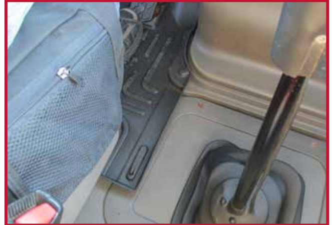
Figure 10 - Driver Mat Hook Installation

Mark the approximate position where the hook needs to be attached to the floor. Once the position is located, remove the driver mat from the truck.