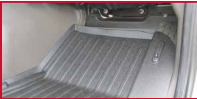
Figure 12 - Properly Installed Driver Mat and Hook

For all other cases install the hook on the dog house trim panel as shown in Figure 13.