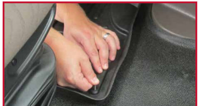
Figure 11 - Properly Installed Driver Mat and Hook

14. While holding onto neck of the hook, lower the driver mat into position and stick the hook to the floor. Apply firm pressure to the hook as shown in Figure 11 for 30 seconds to ensure a proper bond to the rubber floor.