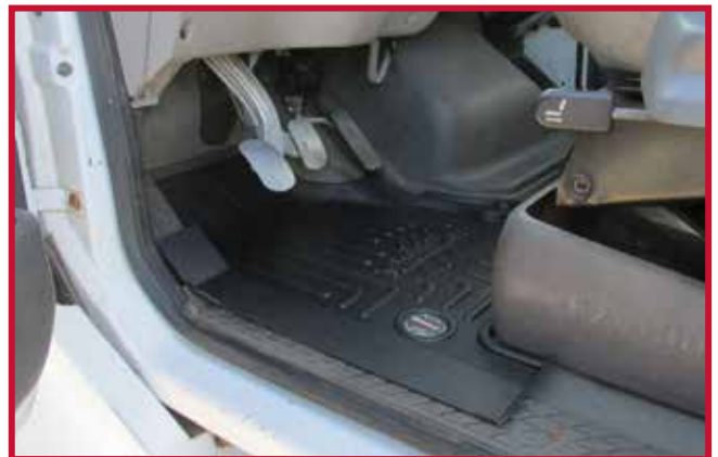
Figure 7 - Driver Mat Installation with EzyRider Seat