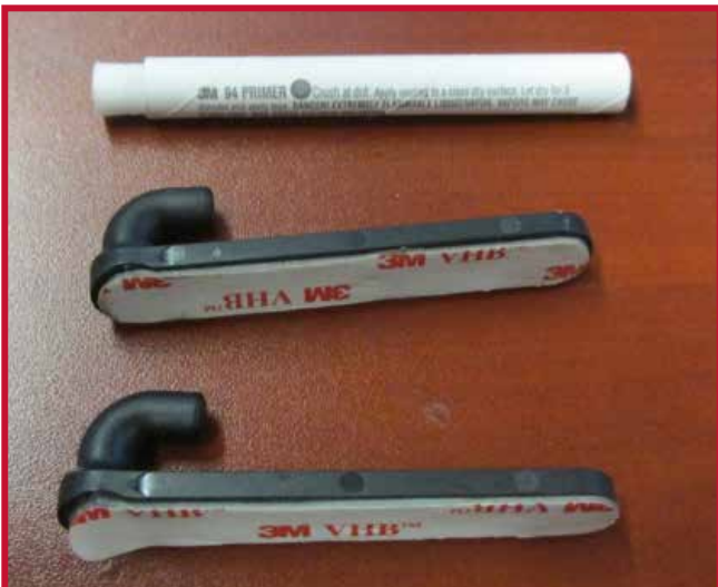
Figure 9 - Retention Hooks and Primer 94

7. Insert a hook up through the hole at the right rear corner of the driver side floor mat. The hook should fit flush with the underside of the floor mat.