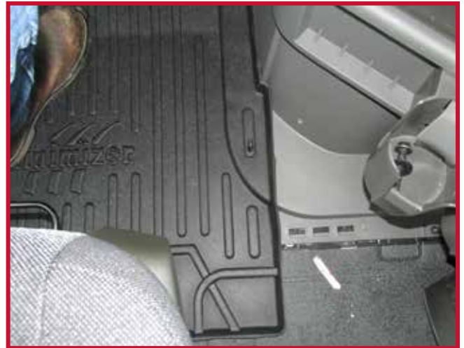
Figure 7 - Driver Mat Hook Installation

18. Pull the driver mat toward the rear of the truck to confirm that the hook is fully engaged into the mat and that the hook is adhered to the molding. If the hook is not functioning properly or the mat cannot be securely installed, do not use a Minimizer floor mat on the driver side of the vehicle.