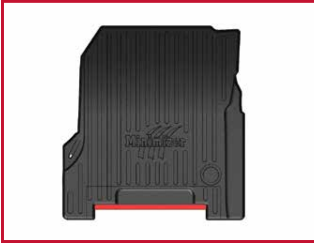
Figure 8 - Passenger Mat Trimming Diagram

22. Install the passenger mat retention hook as shown in Figure 9. Repeat steps 9-16 above to properly attach the hook to the plastic molding near the floor of the truck.