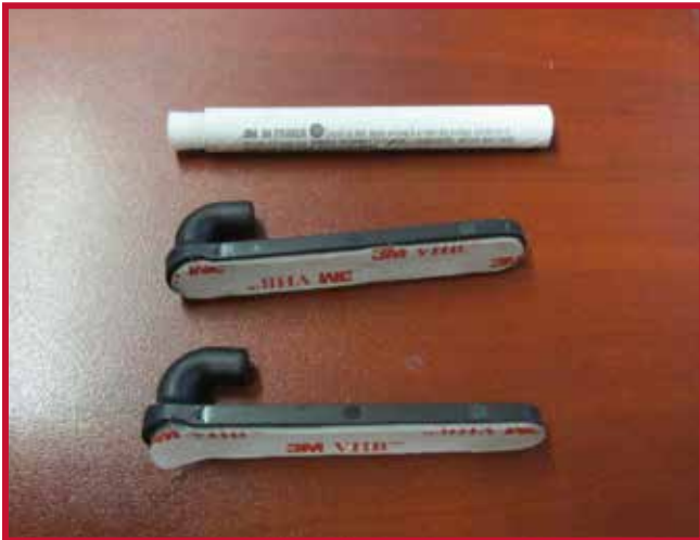
Figure 5 - Retention Hook and Primer 94

8. Insert one hook through the hole at the right edge of the driver mat. The hook should fit flush with the underside of the driver mat.