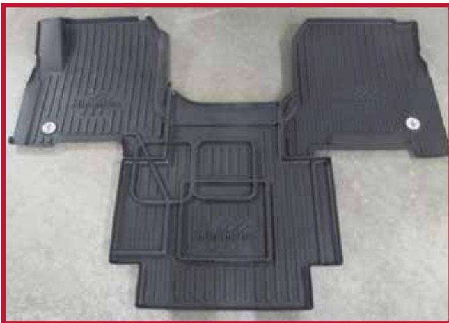
Figure 2 - Floor Mat Kit #10002798