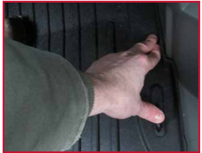
Figure 6 - Apply Pressure to Hook

17. For optimal adhesion do not disturb the hook for a period of 20 minutes after installation. Figure 7 below shows the properly installed driver mat and hook.