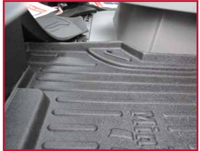
Figure 9 - Passenger Mat Retention Hook Location

23. Prior to operating the vehicle, read the Safety Instructions for Vehicle Operation.