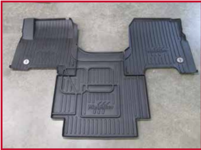
Figure 1 - Floor Mat Kit #10002792