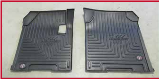
Figure 1 - 10002807 Contents