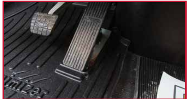
Figure 5 - 10002853 Driver Mat Installation

• In some cases a steel or plastic electrical enclosure will be mounted on the floor area in the left front corner of the cab as shown in Figure 6. If the electrical enclosure is present, the left front portion of the driver mat will need to be hand trimmed along the raised rib. The area to trim is shaded red in Figure 7.