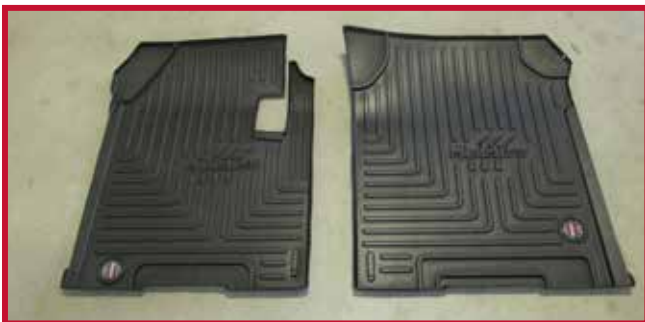
Figure 3 - 10002853 Contents

* 10002853 passenger mat requires hand trimming. Refer to installation step 15 for details.