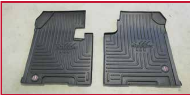
Figure 2 - 10002841 Contents