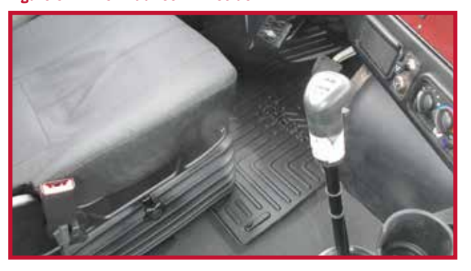
Figure 9 - Driver Mat Hook in Position

Mark the approximate position where the hook needs to be attached to the floor. Once the position is located, remove the driver mat from the truck.