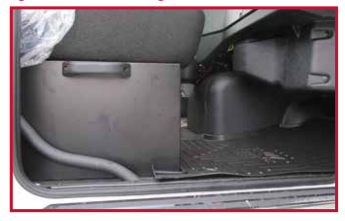
Figure 12 - Fixed Base Passenger Seat with Trimmed Mat

Note: The passenger floor mat is designed to accommodate both fixed seats and suspension seats. Trucks that are equipped with a fixed base passenger seat as shown in Figure 12 will need to be hand trimmed prior to installation. Aftermarket seats may also require hand trimming. There are two raised ribs molded into the passenger mat to act as trim guides. To confirm which line to trim along test fit the mat against the seat base. Use a sharp utility knife to trim along the outside edge of the rib. Preserve the rib for liquid containment.