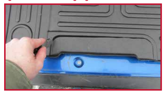
Figure 7 - Driver Mat Trimming Diagram

6. Inside the package with the installation instructions, locate two black plastic retention hooks and a white tube of Primer 94 as shown in Figure 8.