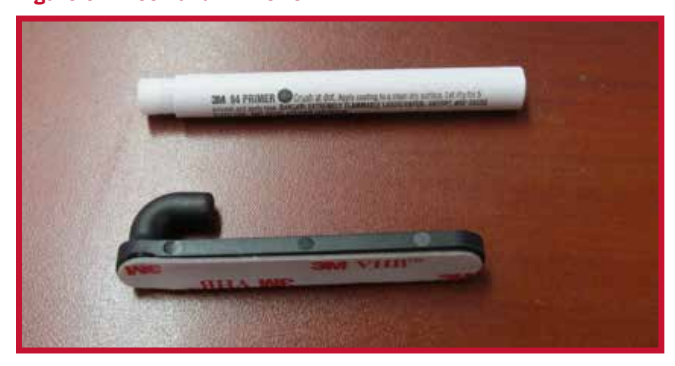
Figure 8 - Hook and Primer 94

6. Inside the package with the installation instructions, locate two black plastic retention hooks and a white tube of Primer 94 as shown in Figure 8.