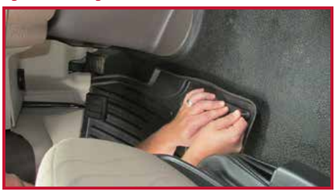
Figure 11 - Passenger Mat In Position

15. Position the passenger floor mat in the truck. Make sure the passenger mat is pushed all the way forward so the outside lip makes full contact with the doghouse trim panel and fire wall as shown in Figure 11.