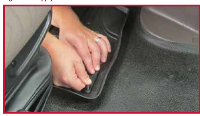
Figure 10 - Apply Pressure to Hook

15. Position the passenger floor mat in the truck. Make sure the passenger mat is pushed all the way forward so the outside lip makes full contact with the doghouse trim panel and fire wall as shown in Figure 11.