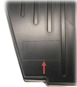
FIGURE 2 - HOOK STRIP