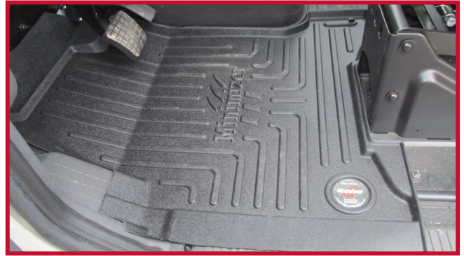
Figure 3 - Driver Mat in Position