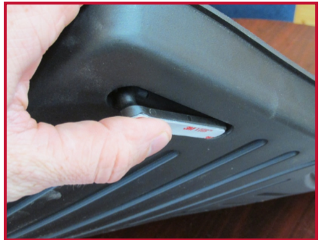
Figure 5 - Hook Insertion