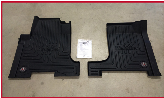
Figure 2 - Kit #10002433 Contents