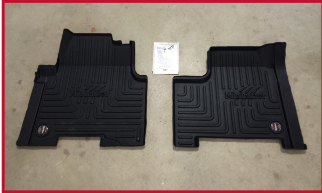
Figure 1 - Kit #10002412 Contents