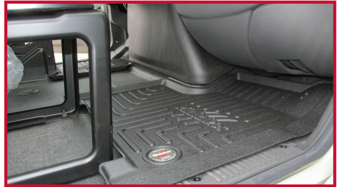
Figure 8 - Passenger Mat with Fixed Seat

18. Pull the driver mat toward the front of the truck to confirm that the hook is fully engaged into the mat and that the hook is adhered to the floor. If the hook is not functioning properly or the mat cannot be securely installed, do not use a Minimizer floor mat on the driver side of the vehicle.