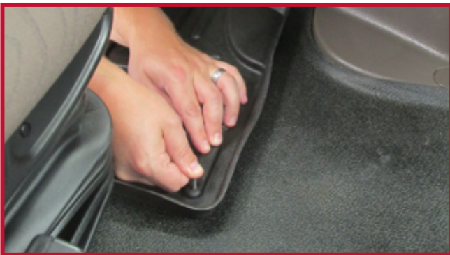
Figure 7 - Apply Pressure to Hook

16. For optimal adhesion do not disturb the hook for a period of 20 minutes after installation.