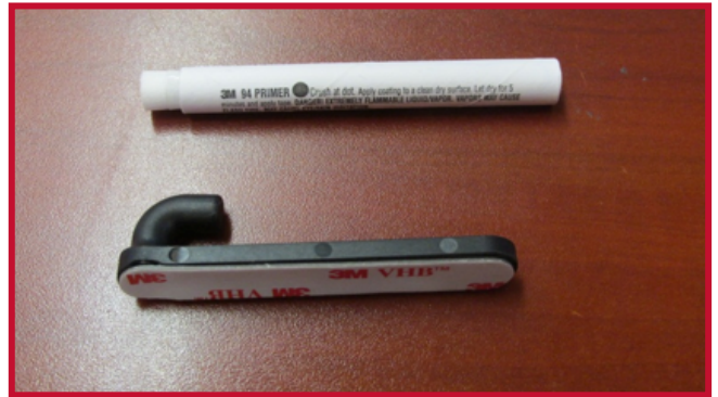
Figure 4 - Hook and Primer 94