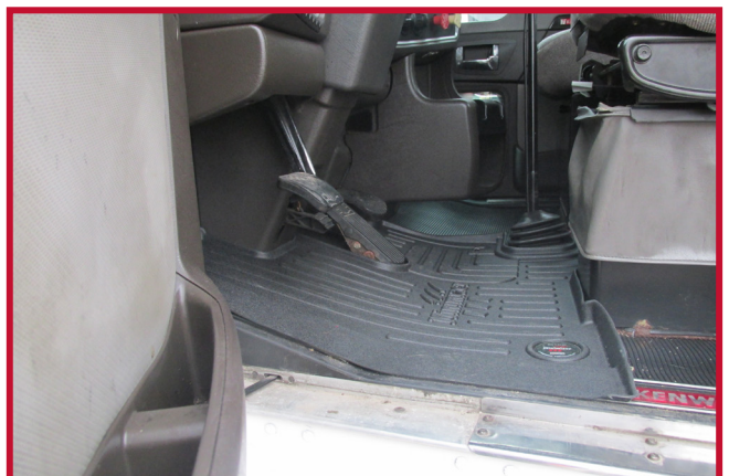
Figure 7 – Driver Mat Fit