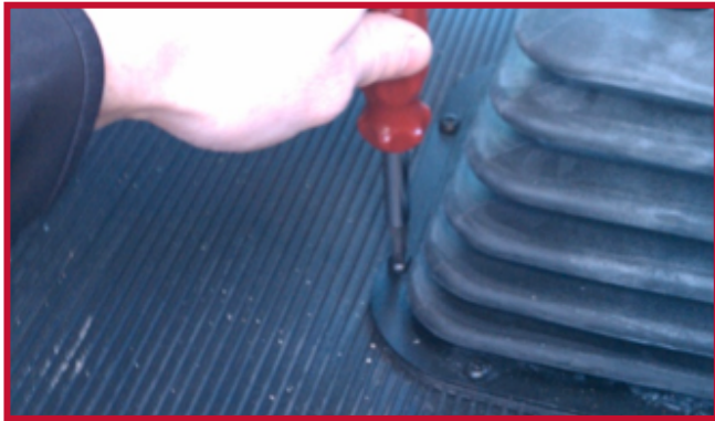
Figure 8 – Remove Screw from Shifter Boot

• Insert the screw through the hole in the retention hook as shown in Figure 9.