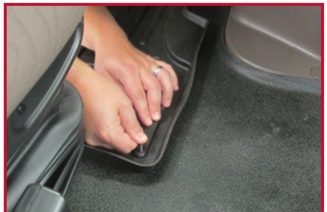
Figure 12 – Apply Pressure to Hook

• For optimal adhesion, do not disturb the hook for a period of 20 minutes after installation.