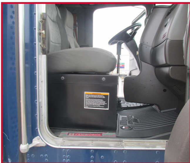
Figure 14 – Passenger Seat Battery Box with Trimmed Floor Mat

• Use a sharp utility knife to cut the mat. Follow along the inside edge of the tall rib and preserve the rib for liquid containment purposes. See Figure 15.