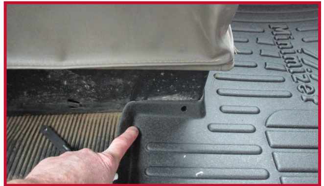
Figure 10 – Driver Mat Hook Location

• The retention hook will be attached to the right side of the driver seat base via a slotted hole in the vertical wall of the driver mat as shown Figure 10.