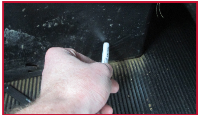
Figure 11 – Apply Primer to Seat Base

• Allow the Primer 94 to dry on the seat base surface for 5 minutes.