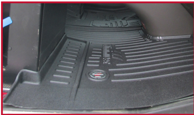
Figure 13 – Passenger Mat Fit

• If the truck is equipped with a passenger seat with under seat battery storage as shown in Figure 14, the passenger mat must be trimmed in order to fit properly.