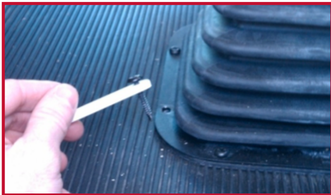
Figure 9 – Install Hook on Existing Screw

• Replace the screw in the original hole and tighten. Orient the floor mat hook so it points toward the front of the truck.