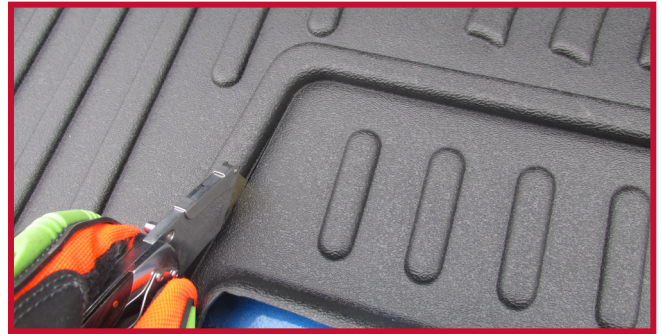
Figure 15 – Trimming Passenger Mat

13. Install the passenger mat retention hook. Apply primer to the area shown in Figure 16 and repeat step 7b above to properly attach the hook to the plastic door threshold. Figure 17 shows a proper hook installation.