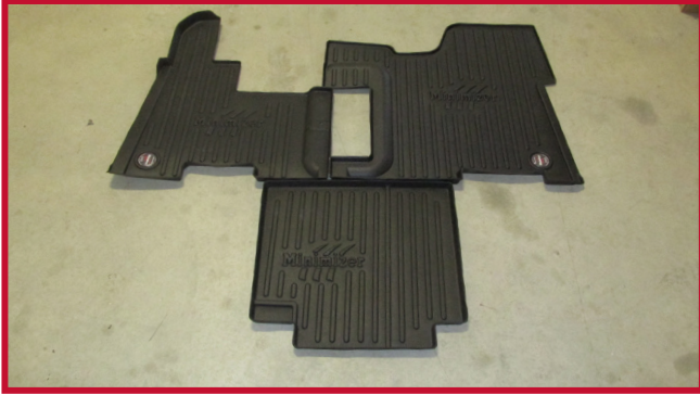
Figure 1 - KIT 10002688 Contents

• Kit 10002688 shown in Figure 1 is compatible with Peterbilt 378, 379, 385, 357 trucks model years 2006-2007 and 365,367,384,386,388,389 trucks equipped with an automatic transmission with a control tower mounted to the floor for model years 2006-2021.