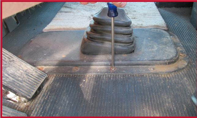
Figure 6 - Screw Removal

b) Locate the retention hook; poly spacer and ¼"x 1.75" machine screw; shown in Figure 7. Insert the screw through the hole in the retention hook and place the black poly spacer on the bolt below the hook.