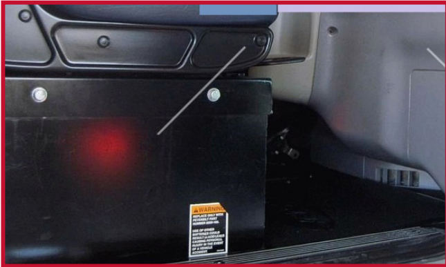
Figure 2 - Passenger Seat with Battery Storage