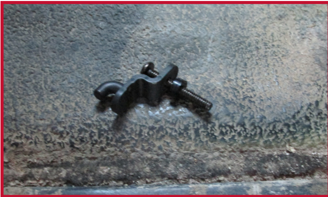
Figure 7 - Hook and Spacer Assembly

c) Insert the hook assembly through the transmission cover and tighten using a #3 Phillips screwdriver. Orient the floor mat hook so it points straight toward the gearshift as shown in Figure 8.