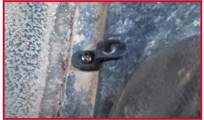
Figure 8 - Proper Hook Orientation

9. Install the driver side floor mat and engage it into the retention hook. The driver mat must be pushed all the way forward so the front lip is makes full contact with the lower dashboard kick panels. Nest the left rear edge of the passenger mat over the top of the right rear edge of the driver mat.