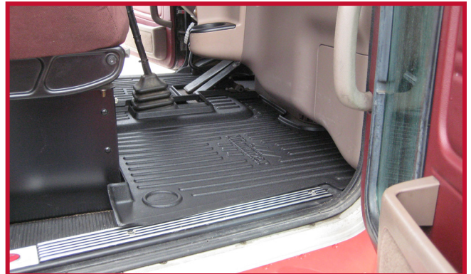
Figure 5 - Passenger Mat Fit

7. Next install the mat for the passenger side of the vehicle as shown in Figure 5.