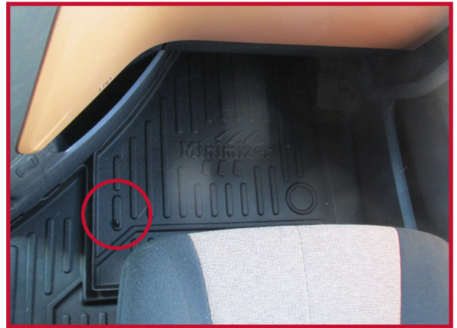
Figure 10 - Passenger Mat Retention Hook Location

23. Prior to operating the vehicle, read the Safety Instructions for Vehicle Operation.