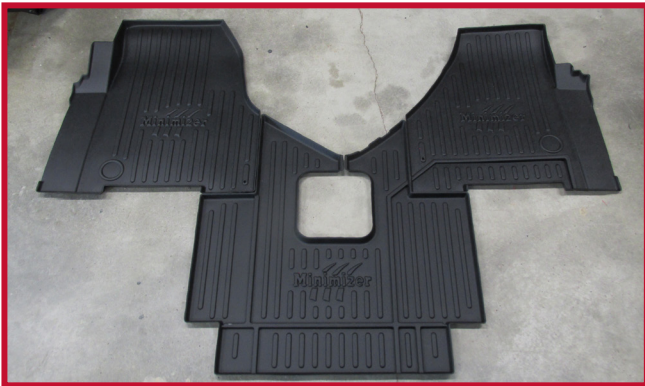
Figure 1 - Kit #10002331 Contents