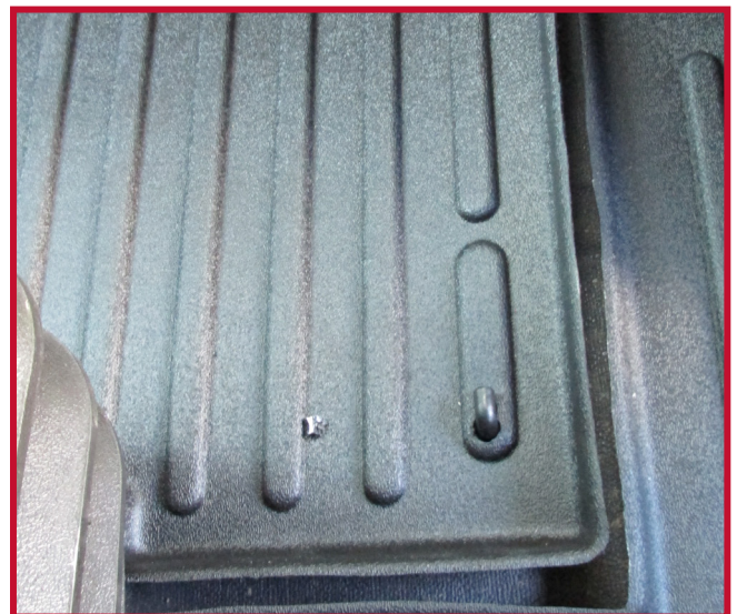
Figure 8 - Driver Mat Hook Installation

18. Pull the driver mat toward the rear of the truck to confirm that the hook is fully engaged into the mat and that the hook is adhered to the floor. If the hook is not functioning properly or the mat cannot be securely installed, do not use a Minimizer floor mat on the driver side of the vehicle.