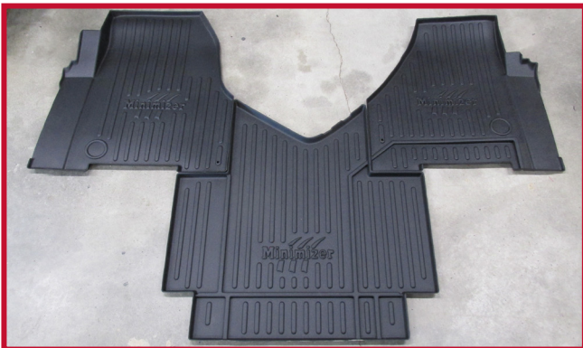
Figure 2 - Kit #10002323 Contents