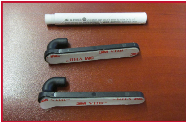
Figure 6 - Retention Hook and Primer 94

8. Insert one hook through the hole at the right edge of the driver mat. The hook should fit flush with the underside of the driver mat.