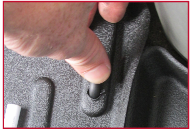
Figure 7 - Apply Pressure to the Hook

17. For optimal adhesion do not disturb the hook for a period of 20 minutes after installation. Figure 8 below shows the properly installed driver mat and hook.